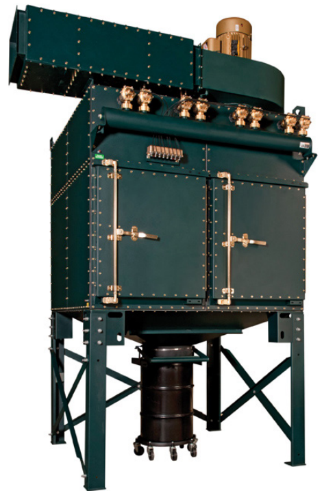
This dry collector uses high efficiency media filter cartridges.

Thus, plant managers and engineers are faced with a balancing act of finding the best dust collection system to capture process dusts effectively while controlling the hazards associated with combustible dusts in the safest yet also most cost-efficient manner possible. There are two basic types of dust collection systems that may be used in these situations: