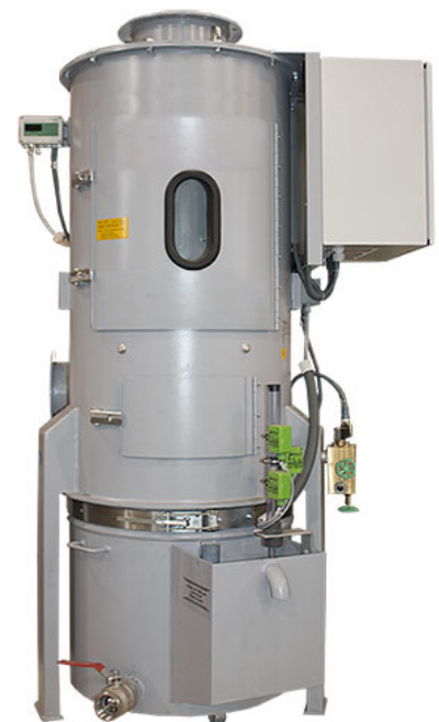
This wet collector is a cyclonic-type scrubber.