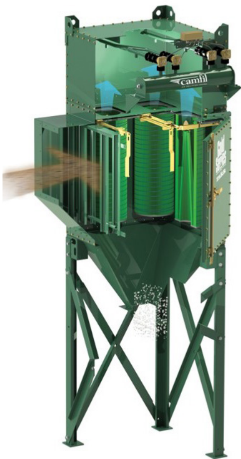
Figure 1: Cutaway view of dry media-type high efficiency cartridge dust collector.

Some filter elements are mounted vertically while other designs mount them horizontally. Of the two types, vertical filters are recommended for several reasons. With horizontal mounting configurations, dust becomes entrained at the top of the filters, and there is no pre-separation of heavy or abrasive particles from the air stream. This situation can shorten filter life and retain large amounts of combustible dust on top of the filter that may contribute to a dust collector fire or explosion. Vertical mounting reduces the load on the filters and helps eliminate these problems, allowing more efficient pulse cleaning that extends filter service life between change-outs.